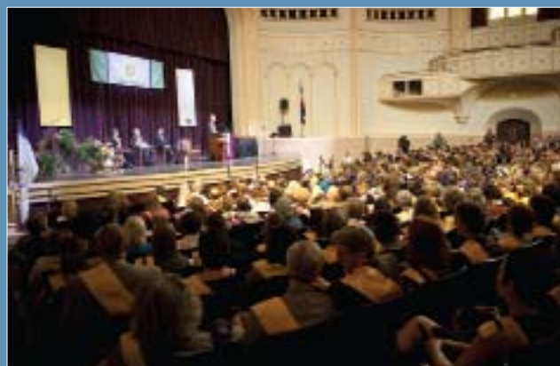
On May 9, approximately 1,650 people attended Naropa University's commencement program held in Macky Auditorium. William Ury delivered the commencement address, "Getting to yes with Yourself."