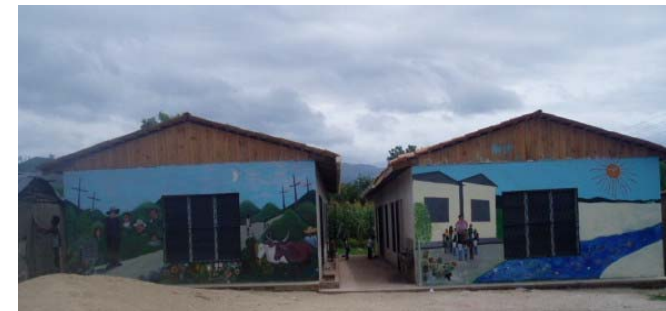
Center in Nueva Esperanza, 2006

AACC/PIEAT & the ECE Students from Naropa University